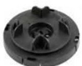
TBR-WH AUTOLEVELLING HEAD FOR WOODEN BEAM HEAD HOLDER - 40-50 mm