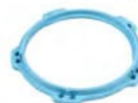
TBR-CR FIX COLLAR TB-CR.