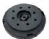
TBR-C AUTOLEVELLING HEAD.