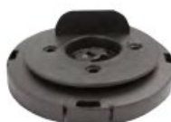
TBR-WHS AUTOLEVELLING HEAD FOR WOODEN BEAM HEAD SIMPLE - up to 80 mm.