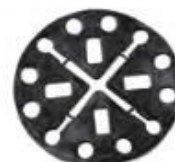
TB-A DAMPER TB-A (40 Units Bags)