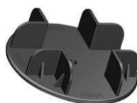
TBF-WH X formed Carcass Assembly Equipment does sit on top and central of the pedestal.