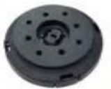
TBR-C AUTOLEVELLING HEAD.