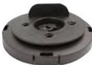
TBR-WHS AUTOLEVELLING HEAD FOR WOODEN BEAM HEAD SIMPLE - up to 80 mm.