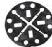
TB-A DAMPER TB-A (40 Units Bags)