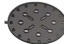
TB-DN Slope Correctors, sit under bottom pedestal, avoids all impacts from drain slopes.