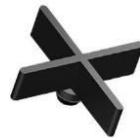
TBF-SC3 Plus shape formed joint strips can be sit in the middle of pedestal and have 3mm thickness Height 16mm.