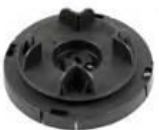
TBR-WH AUTOLEVELLING HEAD FOR WOODEN BEAM HEAD HOLDER - 40-50 mm