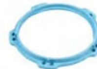
TBR-CR FIX COLLAR TB-CR.