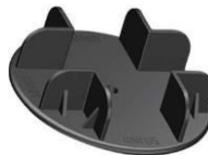
TBF-WH X formed Carcass Assembly Equipment does sit on top and central of the pedestal.