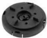
TBR-TS3 AUTOLEVELLING HEAD CROSS 3 mm